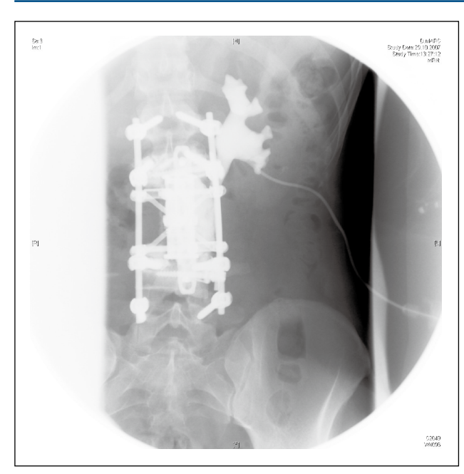
Figure 3. Antegrade ureteropyelography showing left hydronephrosis with long ureteral stricture.

tomosis times of 25 and 17 min, respectively. Warm, cold, and rewarming ischemia time was 18, 130, and 22 min, respectively. Skin incision for KAT was 6 cm and POI was started on day 1 with a VAS of 3. On the 1st postoperative day, the patient presented a fever up to 38.7 which was solved by antibiotics and paracetamol so he was discharged on the 7th postoperative day with a VAS of 1. At a follow-up of 19 months, mean serum creatinine was 120 \mu mol//L with normal vascular perfusion of the autotransplant renal unit at doppler sonography.