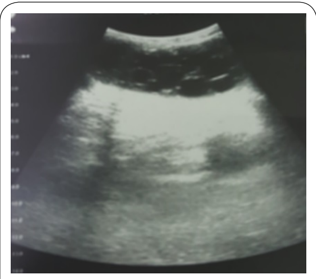
Figure 2. Heterogeneous mass within the stomach.

tectomy (Figure 4). The subcutaneous cystic lesions were removed completely without damaging the cyst wall (Figure 5 and 6), and that extensive irrigation with hypertonic saline solution was performed. Histopathological examination confirmed the diagnosis of hydatidosis. Antihelminthic treatment with 2 x 400 mg of albendazole was administrated for two months to reduce the risk of relapse. One year postoperatively, the evolution was favorable. Clinical follow-up and repeated ultrasound controls were confirmed the absence of recurrence of the hydatid cyst.